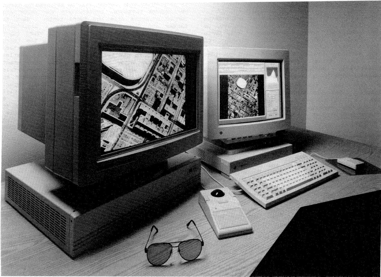
Figure 4 Leica DPW 750 by Helava

Operator selectable cursors and cursor colours are provided. The image display options can be toggled by the user from split screen, stereo, mono, moving cursor, and moving image modes. This provides the variety to suit many personal tastes as well as operationally effective exploitation. Image manipulation includes zooming, rotation, filtering, histogram, and tonal transfer curve applications.