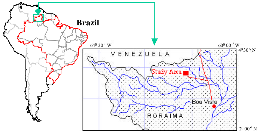
Figure 1. Location of the study area.

The Serra Tepequém, comprised by Middle Proterozoic sandstones and conglomerates of the Roraima Formation (Borges and D'Antona 1988), constitutes an isolated plateau bounded by abrupt sloping erosion scarps, standing up to 1,000 meters above the surrounding metavolcanic country rocks. Mainly savanna open grass fields constitute the vegetation cover in the plateau, whereas surrounding area is covered by a tropical rain forest (see color composite in Figure 2).