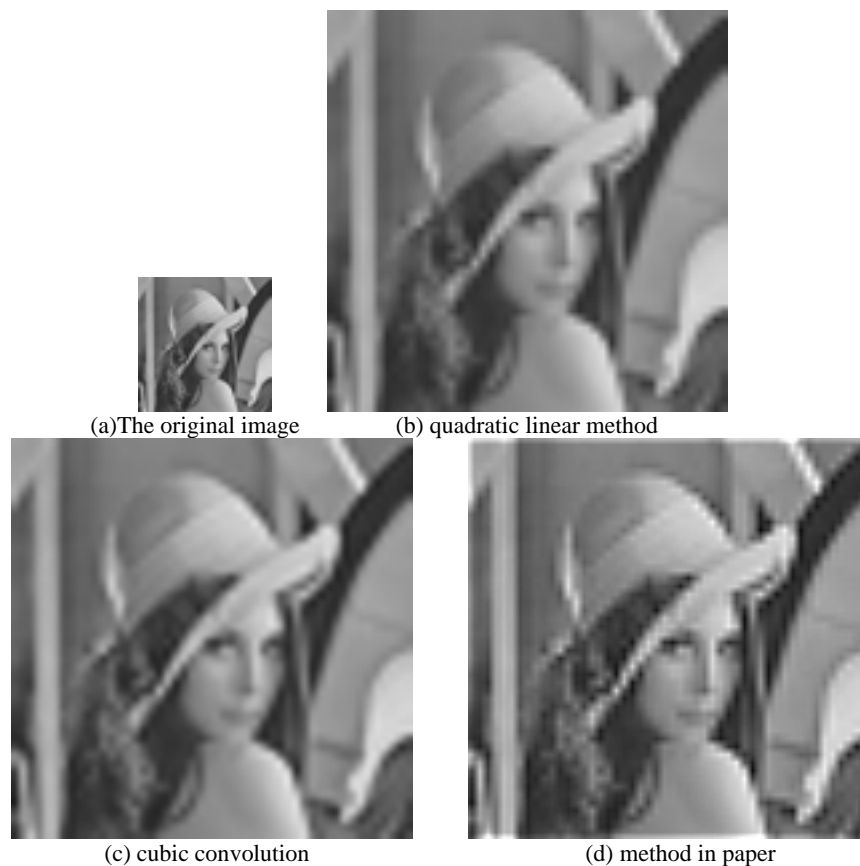
Figure3 Experimental original image and result image

Simulation experiments are designed based on the magnification algorithm presented in this paper. The original image used in the experiment is Lena image (shown as Figure3 a), size of 50 \times 50 . The image is magnified by three times by using quadratic linear method (Figure3 b), cubic convolution (Figure3 c) and the new method presented in this paper (Figure3 d) respectively. The magnification effects are compared.