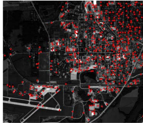
Figure 1. Point distribution over the QuickBird image

The dataset used in this research consists of three satellite images covering West Lafayette city, IN, USA. The first image is an SPOT3 panchromatic image, with a pixel size of 10 meters. The second image is an IKONOS panchromatic image, with a pixel size of 1 meter. The third image is a QuickBird multispectral image, with a pixel size of 2.4 meters. Harris corner detection (Harris and Stephens, 1998) was used to automatically extract corner points in all images. Figure 1 shows the point distribution over the QuickBird image.