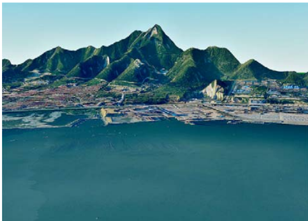
Figure 3. 3D terrain model of coastal zone and island

Build 3D terrain model of coastal zone and island quickly. Digital Coast (DC) requires that building high-precision, true three-dimension, measurable, third-dimension and coastal 3D terrain model should be regarded as virtual platform which is applied to manage coast. However there are heavy workload, low efficiency and no good effects and width and depth that digital coast serves are influenced, when traditional technique is applied in coastal 3D modeling. Coordinates of high-density and high-precision 3D points can quickly be acquired by airborne LIDAR, and big-area 3D coastal model can conveniently be built when point cloud data is used to build model and texture mapping. Furthermore quick dynamic update can be put into effect and true guarantee can be provided for endurance and history of basic data source which is used to build digital coast. See figure 3.