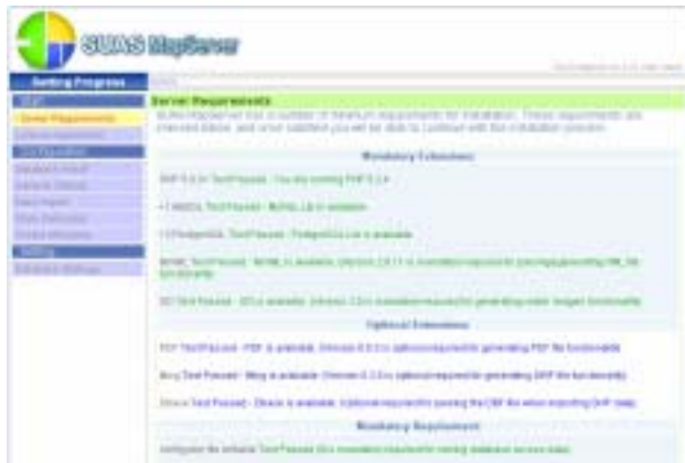
Figure 3: Requirement checking in SUAS installation user interface.