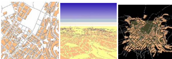
Figure 1: From left to right: 2D map from GetMap request, 2.5D map from GetMap25D request and 3D map from GetMap3D request.

Two special operations extend the capability of map rendering: GetMap25D and GetMap3D (cf. Fig. 1). A 2.5D map has the strongpoint of 2D and 3D. It can have smaller file size than a raster image, but still has the 3D intuitionistic sense. Map in form of 2.5D has been widely used in mobile navigation system. These two operations follow part of the specification of Web 3D Service (W3DS), which is a portrayal service for 3D geodata. SUAS can extrude 2D geodata and coordinate system to 3D geodata and coordinate system with given elevation data, and produce a 3D scene graphs in X3D, VRML, KML, and GML format. Because it is "fake" 3D data, these two requests were named differently from the GetScene request in W3DS to avoid conflicting names.