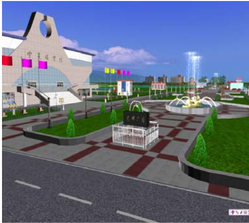
Guangming square of Yinchuan City