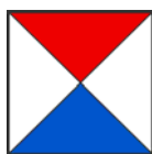
Figure 2. Signal template

A total number of control points were 60; thereof 49 control points in the area of King's Palace and 11 control points covered a wider territory. All control points were signalized by same signal template: 5x5 cm (Figure 2). The template was designed to enable good visibility on images acquired in both photo scales.