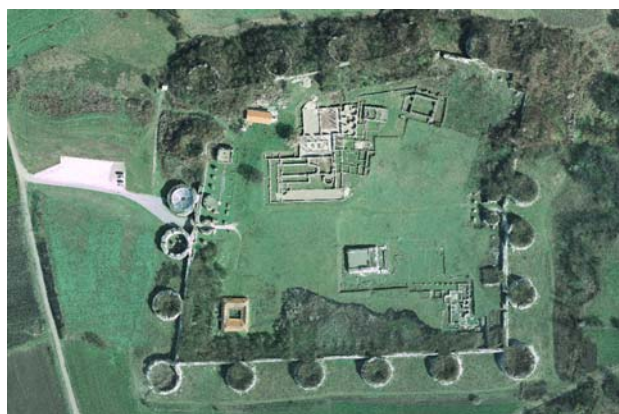
Figure 1. Archaeological site – Fortress

The experiment was performed on archaeological site of FELIX ROMULIANA near Gamzigrad (Serbia). Felix Romuliana in Gamzigrad is thought to have been one of the residences of the Roman Emperor Gaius Galerius Valerius Maximianus, built in the late 3rd and early 4th century (more data to be found at http://en.wikipedia.org/wiki/Gamzigrad ).