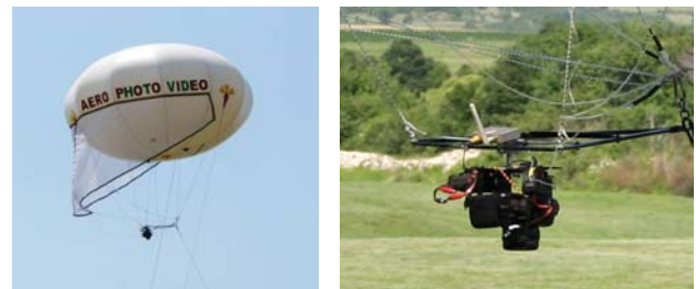
Figure 3. Balloon with camera carrier

Balloon is managed from ground with three ropes. The experiments showed that the major problem for this type of projects is stabilization of the balloon. Even the weakest wind could make it difficult to keep the balloon stable. For this reason a special sail was made. It is tighten to the balloon bottom and its role is to guide the balloon in the wind blowing direction. The result was that wind helps stabilizing the balloon instead of opposite. Sail usage means that the wind direction determines the angle of balloon rotation. That is the reason why motor was constructed, for camera kappa rotation with remote command. With these two additions the balloon became more stable and camera managing much more flexible. The outcome is efficient imaging, simplicity, and imaging in no ideal conditions, with wind.