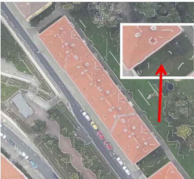
Figure 6. Canny colour edges with shadow-shading

Due to the unfavourable behaviour of quasiinvariants it is not advisable to integrate them in the edge detection for this particular type of application. In addition the vector gradient approaches to colour edge detection already possess a certain degree of invariance.