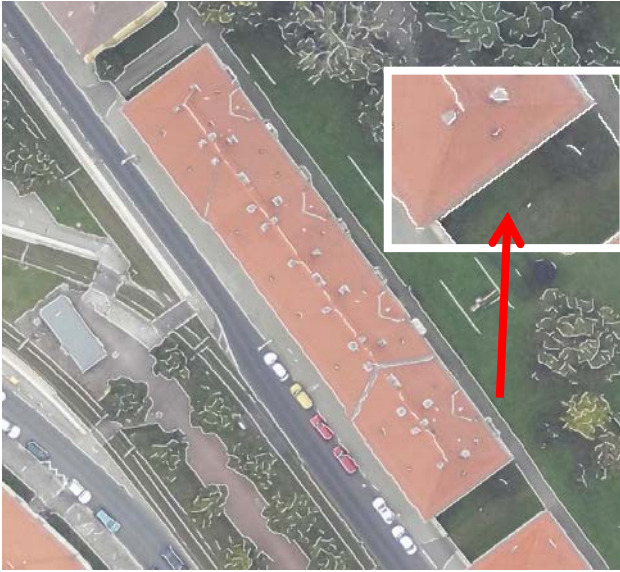
Figure 5. Canny colour edges.

In [Weijer et al., 2006], additional photometric information is used to reason about the physical causes for image discontinuities. The authors proposed the so called photometric quasiinvariants, which like the full invariants (e.g. normalized RGB) provide robustness against shadows and specular reflections, but do not possess the same instabilities. Figure 6 shows the result of Canny edge detection in the RGB colour space with shadow-shading and Figure 7 – with shadow-shading-specular quasiinvariants. It was noticed, that in both cases less luminance edges are found, but the accuracy of the location and orientation of the edge segments is inferior compared to the one with the colour gradient. Those displacements are probably due to the general attenuation of the signal associated with invariants.