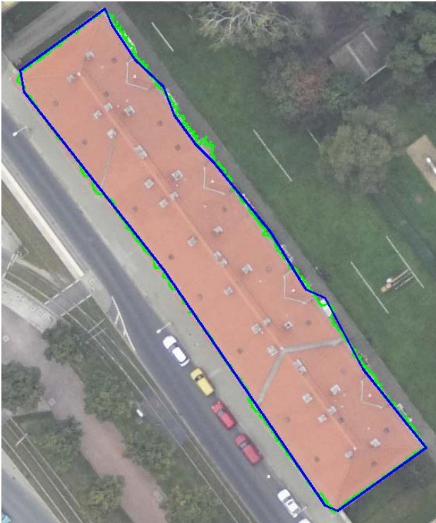
Figure 3. Building outline (green) and its generalization through Ramer's algorithm (blue) projected onto the image.

It is extracted as the outline of the combination of all roof structures. For that a gift wrapping like algorithm has been developed, which uses the neighbourhood information of the triangulation. Because of the discreteness of the LiDAR measurements, the building footprint will contain many short, insignificant edges and needs to be further generalized. To tackle that problem Ramer's algorithm has also been used here (Figure 3). It could be seen that the outline is successfully smoothed, but the edges still deviate from their true position. Because of the higher spatial resolution of the image data it can be used in improving the accuracy of the gutter, e.g. through the extraction of edges.