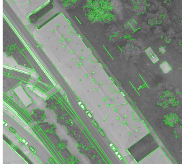
Figure 4. Canny intensity edges.

Here the applicability of different edge detection approaches to colour aerial images is considered. Usually, when processing digital colour images the first thing to do is to disregard the colour information by converting the data to intensity. That makes the application of conventional edge detectors straightforward. However, if neighbouring regions differ only in their chromatic characteristics, they could not be separated. Notice e.g. that the edge between the building roof and the pavement in Figure 4 is almost completely lost.