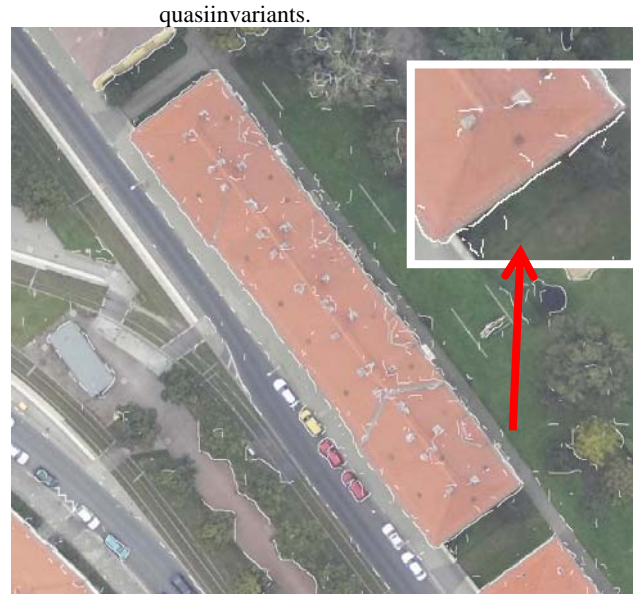
Figure 7. Canny colour edges with shadow-shading-specular quasiinvariants.