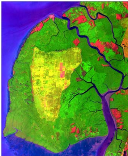
Figure 1. SPOT-5 image of Sungai Kerang

Matang mangrove forest located at West Coast Peninsula of Malaysia with North latitude 4°15'- 5°1' and East longitude 100°2'-100°45'. Matang mangrove forest reserve systematized management started as early as 1904, and gazetted as the best conserved mangrove forest reserve in the world. This mangrove forest reserve is divided into four sub-areas from North to South: North Kuala Sepetang, South Kuala Sepetang, Kuala Trong and Sungai Kerang. Among these sub-areas, Sungai Kerang is formed as an island, where its interior is consists of inland vegetations and surrounded by different mangrove forests. Sungai Kerang has been chosen as study area since its mangrove types is abundant comparing other three sub-areas (Figure 1).