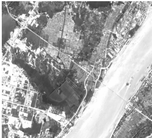
2(c) SPOT Pan image