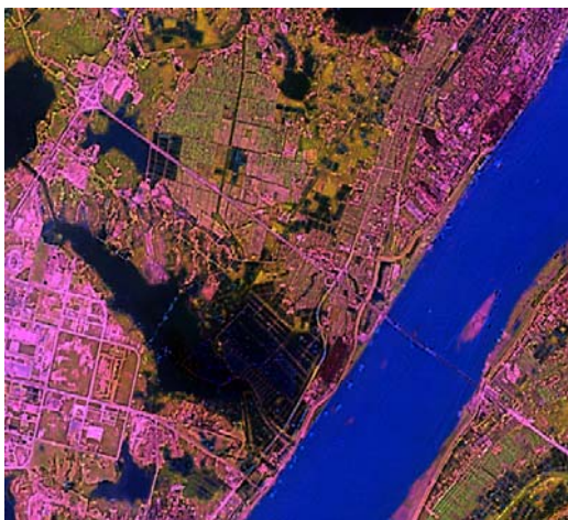
Figure 3. The fused images