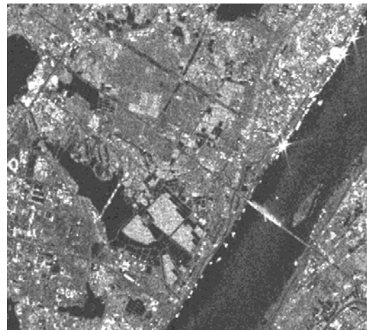
2(a) ENVISAT SAR image

The input dataset is composed of an ENVISAT SAR image of urban area of Wuhan, Landsat-5 TM images (band 3, 4, 5) and a SPOT Pan image. All the data have been accurately co-registered to the SPOT Pan image, as shown in Figures 2(a), 2(b) and 2(c). Texture will be blurred in the fusion image if the accuracy of co-registration among the SAR image, the TM images and the SPOT Pan image is not high enough. Figure 3 is the fused images by proposed fusion method. The fused images are evaluated in visual examination and quantitative analysis.