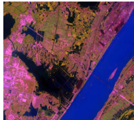
2(b) Landsat-5 TM images (band 3, 4, 5)