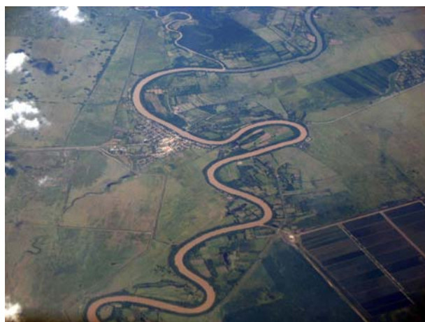
Figure 1. A river menader in Rio Cauro, Cuba

and remove some of them, causes the decrease of sinuosity, number of meanders and also development of straight patterns in river system. The purpose of this research is investigation, recognition and assessment of morphological changes of Gorganrood Great River in vicinity of Gonbad by regarding to comparing of available maps in 2 time periods.