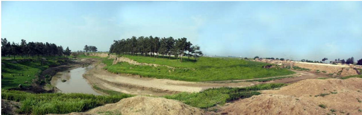
Figure 3. An oxbow meander in Madarsoo river, Iran

Assessment of study reach shows the decrease in the number of meanders before and after of the August 2001 flood event, from 41 meanders to 28 meander, respectively. On the other hand, base on the available map of cross sections of the study reach the mean width and depth of each cross section is calculated. The result of this process is describing in table 2, which is included, the statistical characteristics of the study meanders.