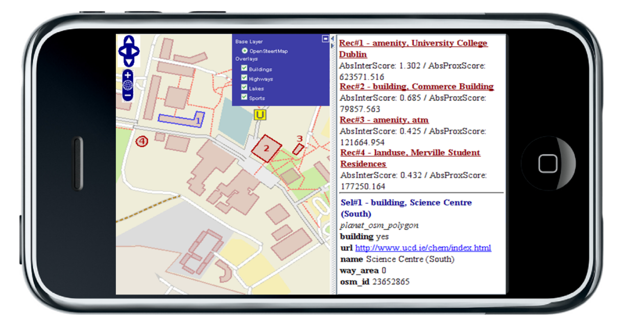
Figure 2: Campus Map on iPhone

consists of an interactive web mapping application to assist users of University College Dublin as they navigate around the campus. The user commences their session by logging into the system, using the smartphone's web browser. The user views the personalised map on the smartphone. This map is personalised and adapted for the user based on their profile built during previous interactions using the personalisation algorithm described in section 3.2. The recommendations are highlighted on the map and detailed information is displayed on a panel to the right. The application, in this case on an Apple iPhone, is shown in Figure 2. A user can zoom in, zoom out, pan and has control over the visibility of layers such as buildings, roads, lakes and amenities. A user can see their position and recommendations on the screen. The recommendations are updated when certain interactions occur. All the user interactions such as map navigation and clicks on items are recorded along with the user location and time so that their profile is continuously updated. A user terminates their session by closing the web browser on the smartphone.