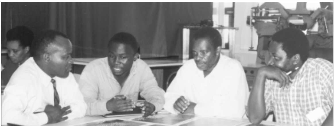
A GIS technologist explaining a point regarding remote sensed images as data source in GIS activities.

This use of GIS in Tanzania is still rather exploratory and ad hoc in nature, although there are some signs of growing maturity in GIS application in diverse fields such as public planning, agriculture, environmental management, civil engineering, surveys and mapping. However, there are considerable barriers to be dealt with if GIS is to become fully embedded in these areas. Major issues concerning awareness and understanding, data quality, data sharing and management need to be addressed. Lack of suitably qualified personnel to manage GIS is another obstacle to GIS implementation. Whereas GIS is now taught in secondary education, colleges and universities in developed countries, Tanzania has only limited teaching of GIS in at higher education levels. Only the University College for Architectural Studies (UCLAS) at the University of Dar es Salaam, Tanzania (UDSM) has GIS professional training in its undergraduate curriculum. Its Department of Land