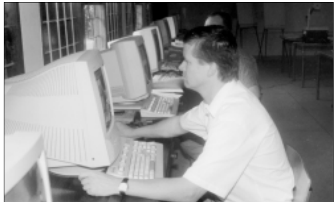
GIS Expert from ITC The Netherlands on the GIS training activities at UCLAS in Tanzania (Source: CICT,UCLAS).