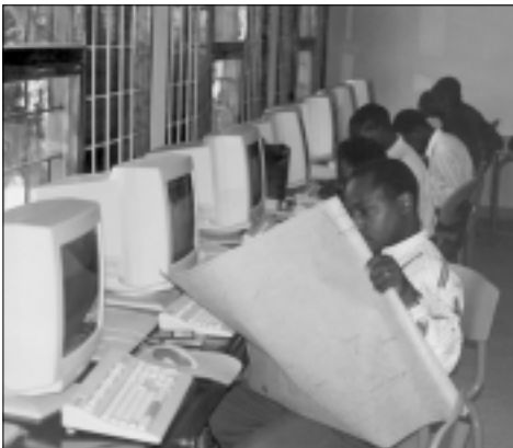
Students in GIS laboratory at UCLAS.

In Tanzania the 1990s witnessed the first use of GIS by several agencies for the purpose of providing support to urban planning management processes. Some organisations adopted it for spatial databases, data input and retrieval and for data manipulation, analysis and decision-making. Areas where GIS is currently being used in Tanzania include the following: natural resources, water management (irrigation and hydrology), ecological monitoring, tourism, agriculture, land information systems, demography and census. There are, however, many other organisations that use GIS in areas not mentioned above. Geo-