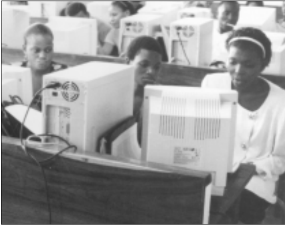
The Computer Laboratory at UCLAS for students and other trainees.

Surveying is the only one of the country's universities to have a full GIS teaching programme in its undergraduate degree course in land surveying. The UDSM, in its post-graduate course in computer science, has GIS as an optional subject, while geology, geography and environmental studies offer some GIS possibilities. This makes the problem of availability of qualified personnel for sustainable GIS implementation not easy to solve.