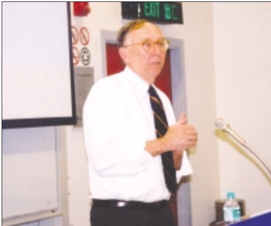
Dr Jack Dangermond delivering his keynote speech.