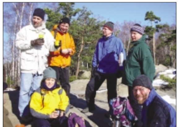
Some participants of the hiking tour.