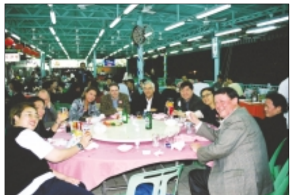
Reception on an outer island of Hong Kong.