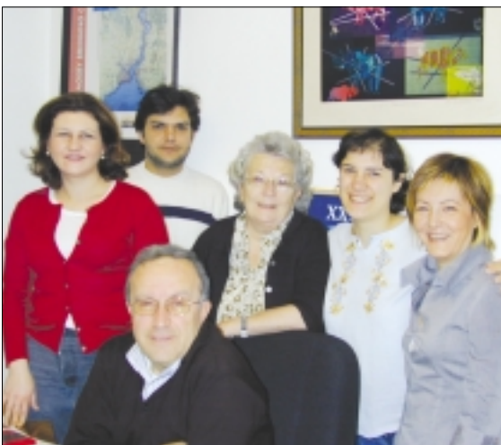
The Organising Committee.

Congress tourism is a rapidly expanding market segment and as such requires specialised expertise on the service side. Here we relied on the facilities provided by an experienced travel agent, Magister, who were prepared to invest both time and money in their faith that we, as the local branch of ISPRS would be successful in our bid for the congress.