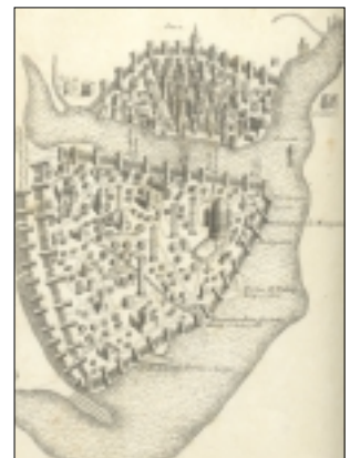
Old map of Istanbul (1422 - Christopher de Bondelmonte Florentine Monk. 1711 Edition).

impress the delegates at the XIXth Congress in Amsterdam who faced the difficult task of choosing between three world famous cities, each with its unique characteristics. Istanbul finally won, not only due to the quality of its presentation, but also because of the favourable physical aspects of the available facilities both as a congress hall and exhibition venue as well as the proximity of its numerous first class hotel facilities.