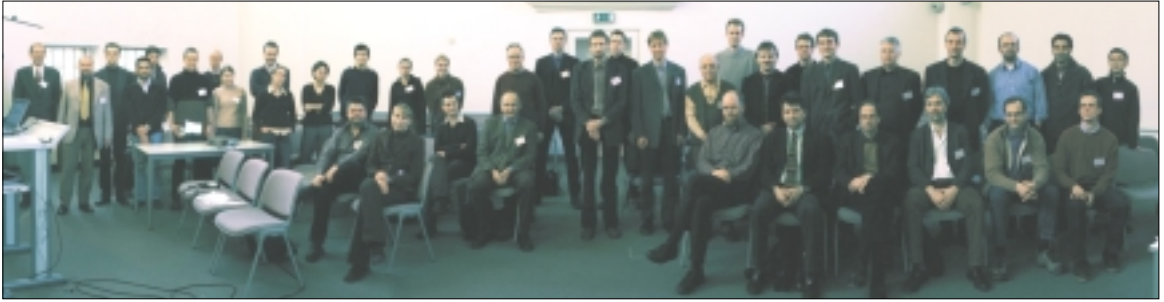
Panoramic image of the participants attending the workshop.

presentation was a review of panoramic imagery with special emphasis on photogrammetric applications.