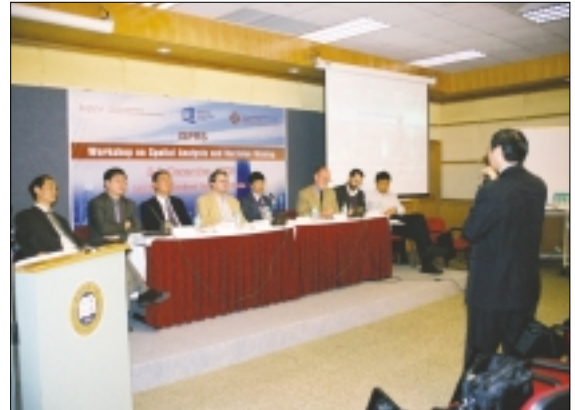
Panel discussion on future aims of spatial analysis and decision support system research.

During the three-day workshop program, 9 technical sessions were held covering broad topics related to spatial analysis and spatial decision making systems. These include: