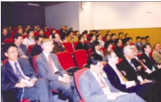
The opening ceremony.

Spatial decision-making based on a combination of image-based and vector data is an important activity in many application domains. The underlying paradigm of field versus object-based models has become an extensively researched area in many disciplines ranging from theoretical to application oriented. The support of decision making with knowledge-based techniques (rule-based systems) and artificial neural networks has found many useful applications reported in the literature. We observe an increased interest in combining standard GIS functionality with novel approaches taken from fuzzy logic and artificial neural network technology. The ultimate goal of acquiring spatial data is for value-added applications. One means to such applications is spatial analysis. It has been pointed out by many GIS experts that current GIS lack of spatial analysis functionality. Spatial analysis can be carried out through either numeric analysis or visual analysis (i.e. visualisation). These two means together form exploratory data analysis.