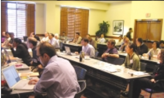
Photographs taken during sessions.