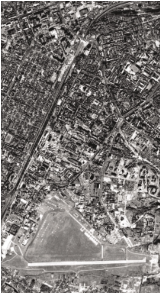
Figure 1: Part of Kiev, Ukraine obtained on May 19, 2005 using Fore Camera.

(GMT). Cartosat-1 carries two state-of-the-art Panchromatic (PAN) cameras that take black and white stereoscopic images of the earth in the visible region of the electromagnetic spectrum. The swath covered by these high resolution PAN cameras is 30km and their spatial resolution is 2.5 meters. The cameras are mounted on the satellite in such a way that near simultaneous imaging of the same area from two different angles +26^\circ and -5^\circ is possible. This facilitates the generation of accurate three-dimen-