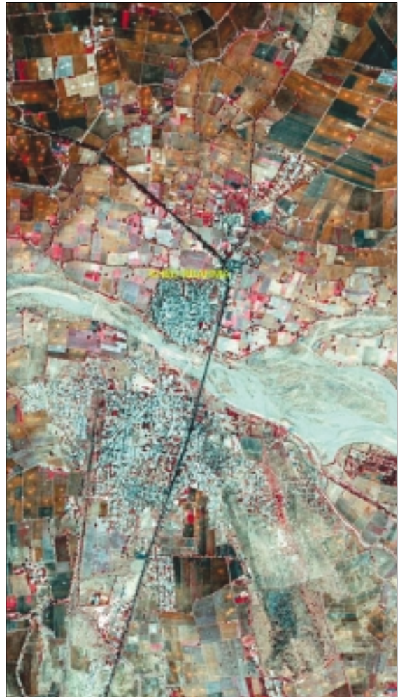
Figure 2: Part of Khed brahma, Gujarat, India (Merged product of Cartosat-1 PAN Aft 08 May 2005 & Resourcesat-1 LISS IV MX 24 Mar 2004).